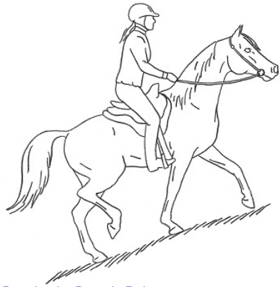
Drawing by Beverly Roberts